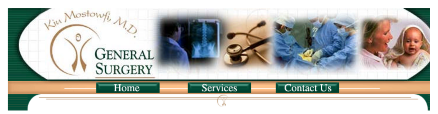
General Surgery Services - Oak Forest, Chicago South Suburbs